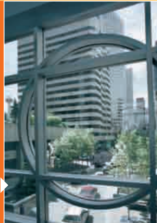
The view looking south from one of the +15 bridges over Barclay Mall.